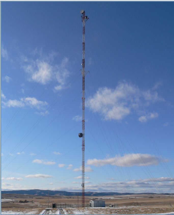
Typical guyed structure