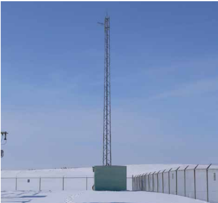
The proposed telecommunications tower will look similar to the one pictured here.

A telecommunications tower transmits data to our system control centre, allowing us to monitor the operation of the electric system and ensure the safety and reliability of the system for our customers.