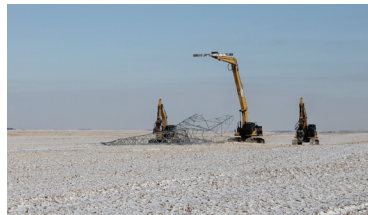
A 911L structure being removed near Clareholm in March 2017