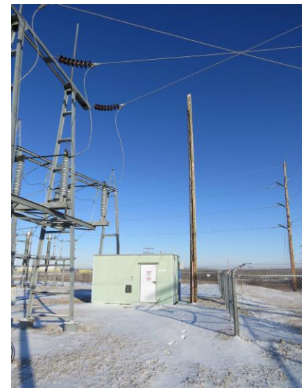
The existing Metiskow telecommunications tower

Telecommunications poles transmit data to our system and control centre, allowing us to monitor the operation of the electric system and ensure the safety and reliability of the system for our customers.