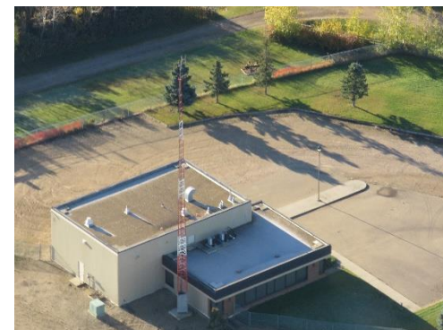
Above: The existing Tofield telecommunications tower and radio site.

Telecommunications towers transmit data to our system and control centre allowing us to monitor the operation of the electric system and ensure the safety and reliability of the system for our customers.