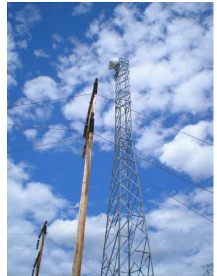
Above: The existing Sagitawah telecommunications tower

Telecommunications towers transmit data to our system and control centre allowing us to monitor the operation of the electric system and ensure the safety and reliability of the system for our customers.