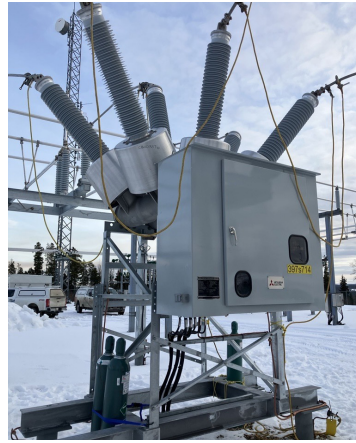
The new transformers will look similar to the picture on the left. The new circuit breakers will look similar to the picture on the right.