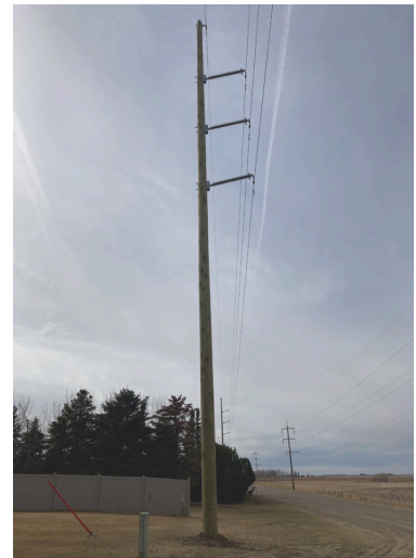
The stacked conductor structure will look similar to the above image but made of self-weathering steel

Riser structures occur where an underground cable comes above ground to connect to the electrical grid. If a double-circuit option is required in the areas where underground is being considered, two riser structures will be required at the end of each underground segment compared to one riser structure required on each end with a single-circuit option.