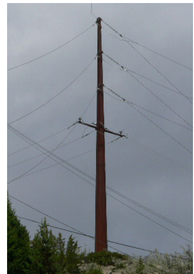
Example of a self-weathering steel structure with an underbuilt distribution line

For more information on the relocation of the distribution lines, please contact 310-WIRE (9473).