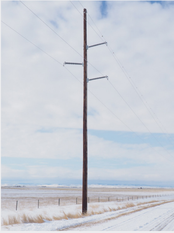
Above: Monopole structure