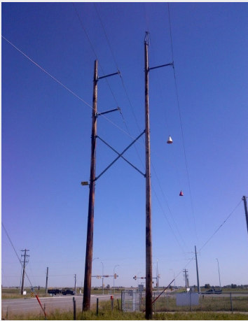
Above: Two-pole structure