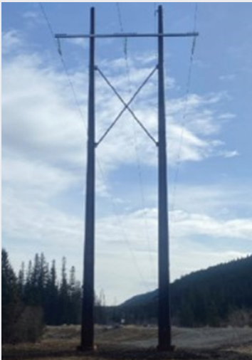
Above: H-frame structure

Please note: The structures for the rebuilt line will look similar to the those shown in this package.