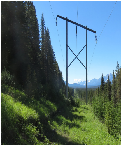
The proposed new structures will look similar to these existing structures.

To facilitate construction, access trails and construction workspace may be required. Construction workspace is required for the safe construction of the transmission line. AltaLink will consult with affected stakeholders regarding potential construction workspace and access trails.