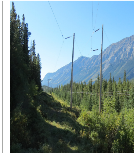
The existing wood monopole structures that need to be replaced.