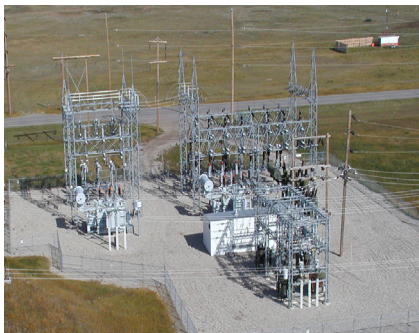
Above: The existing High River 65S Substation