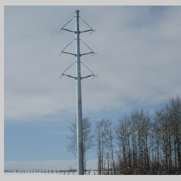
Double Circuit Monopole

Please note that these structure photos are not to scale.