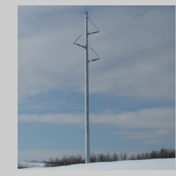
Single Circuit Monopole

Central East Transfer-Out project requires either one or two circuits. AltaLink is planning to use monopole structures for its transmission line (see below). The structure type built will depend on how many circuits are approved. Either structure type could be used on any of the alignments.