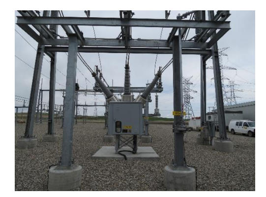
Empress 394S Substation