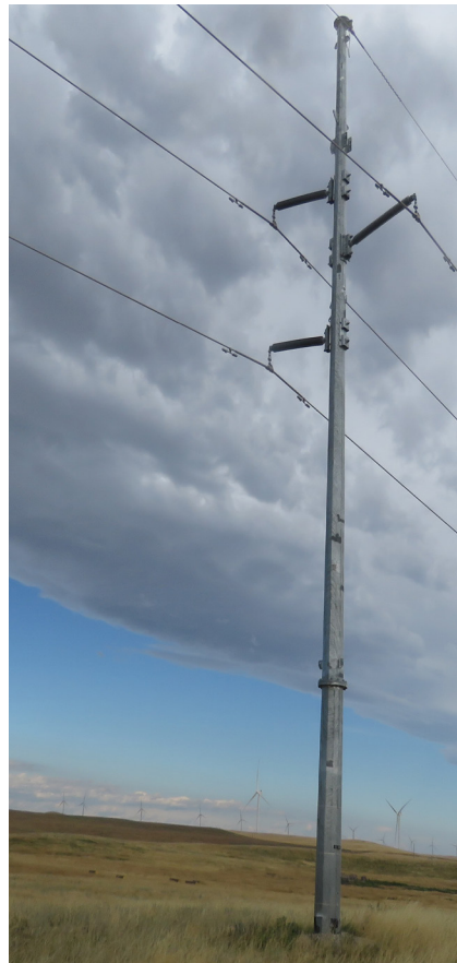
An example of the proposed Monopole structure