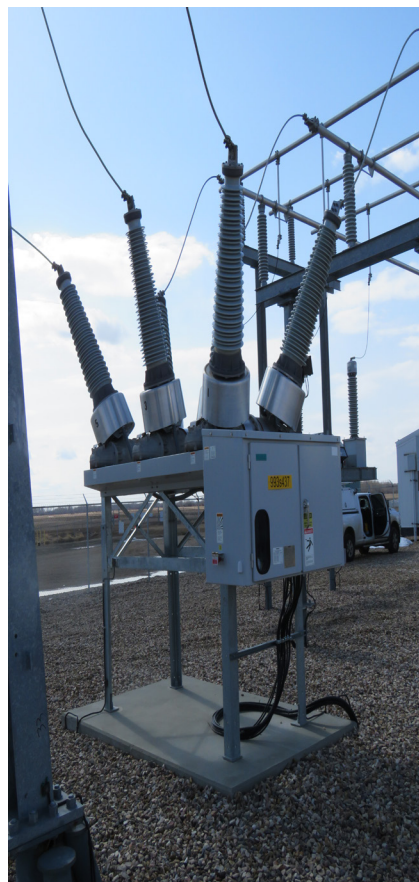
The new circuit breaker will look similar to the picture above