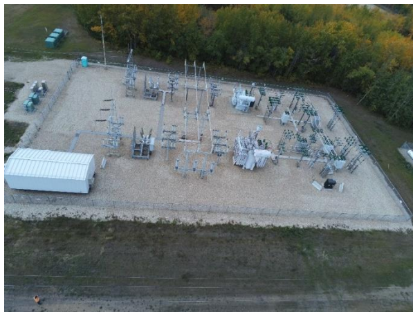
The St. Albert Substation