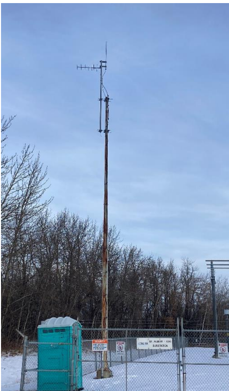
The new telecommunications tower will look similar to the photo above.

All work related to this project, including the potential use of cranes, will occur on land owned by AltaLink. Access to private property is not required.