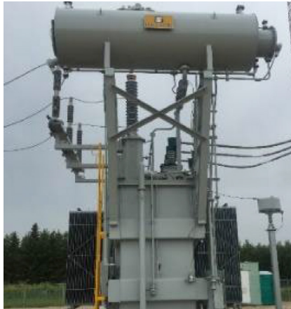
The new transformer will look similar to the picture above

Please refer to the map included in this package for an overview of the proposed project area.