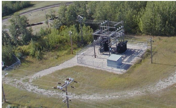
Above: The Wabamun 2739S Substation and 124L transmission line.