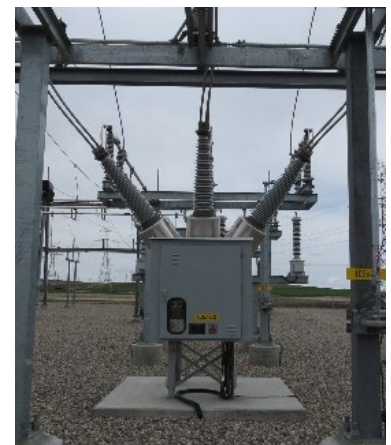
The new transformer will look similar to the picture on the left. The new circuit breakers will look similar to the picture on the right.