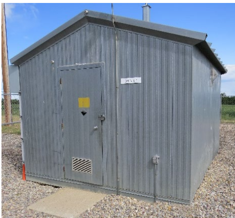
The old control building.

To avoid a potential power outage while completing work, AltaLink will temporarily install a mobile substation. The mobile substation will be located outside of the substation, on the east side on land owned by AltaLink.