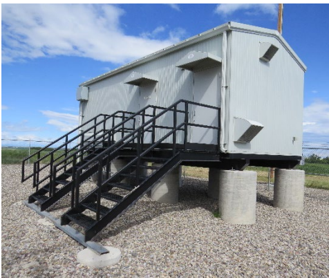
The new control building.